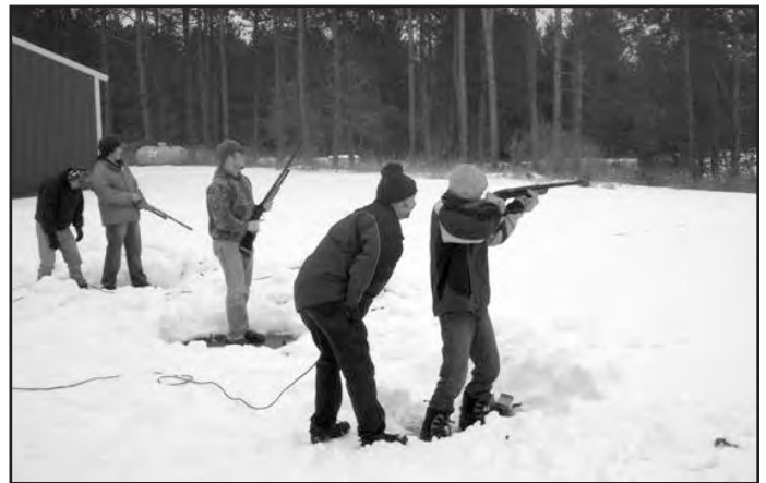
Keeping Youth Involved (KYI) group shooting trap mid January

quantity that can be ordered from the state nurseries is 1000 tree seedlings, 500 wildlife shrubs or one packet. Wildlife, energy, and shoreland packets include 300 seedlings each.