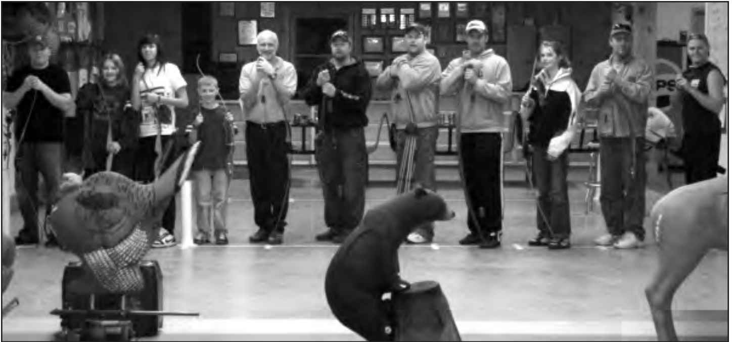
String Shoot Spring 2008