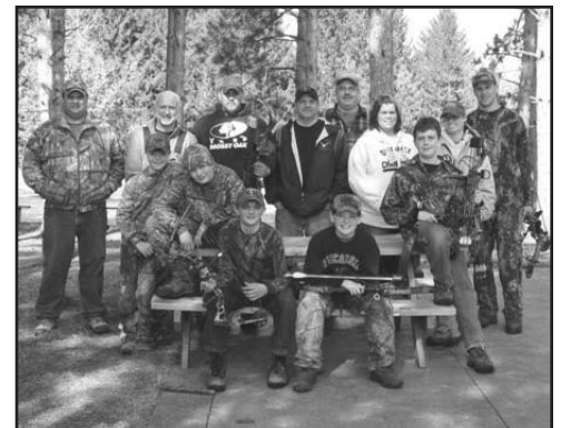
2009 WRR&GC Sponsored Bowhunter Education Class of 2009